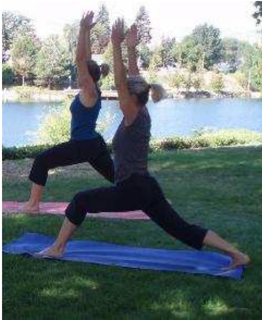
September brought the surreal Sunset Yoga event. Yoga outdoors at sunset to live acoustic music by 'Just Plain Darin'